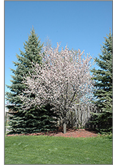
Newport Plum in bloom

This tree should only be grown in full sunlight. It does best in average to evenly moist conditions, but will not tolerate standing water. It may require supplemental watering during periods of drought or extended heat. It is not particular as to soil type or pH. It is highly tolerant of urban pollution and will even thrive in inner city environments. This is a selected variety of a species not originally from North America.