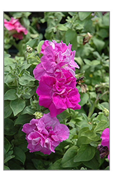
Double Madness Lavender Petunia flowers