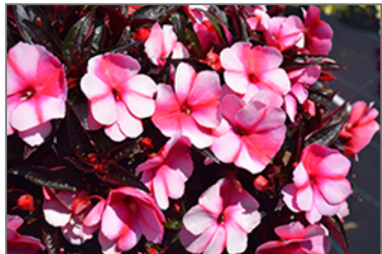
Super Sonic Sweet Cherry New Guinea Impatiens flowers