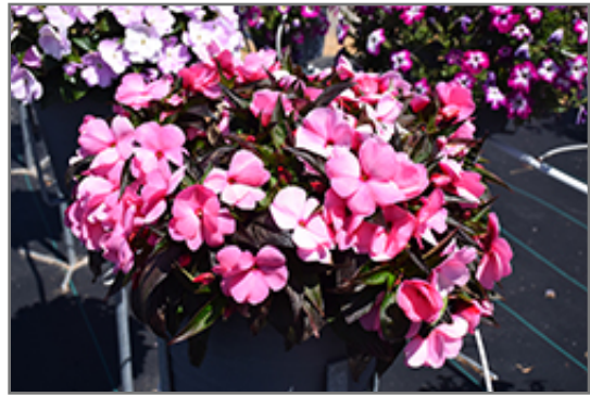
Sonic Light Pink New Guinea Impatiens in bloom

Sonic Light Pink New Guinea Impatiens will grow to be about 12 inches tall at maturity, with a spread of 12 inches. When grown in masses or used as a bedding plant, individual plants should be spaced approximately 10 inches apart. Its foliage tends to remain dense right to the ground, not requiring facer plants in front. This fast-growing annual will normally live for one full growing season, needing replacement the following year.