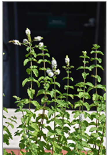
Spearmint flowers