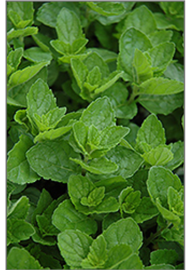
Spearmint foliage

Spearmint features bold spikes of lilac purple tubular flowers with white overtones rising above the foliage in late summer. Its attractive fragrant oval leaves remain green in color throughout the season.