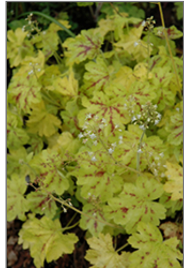
Solar Power Foamy Bells flowers