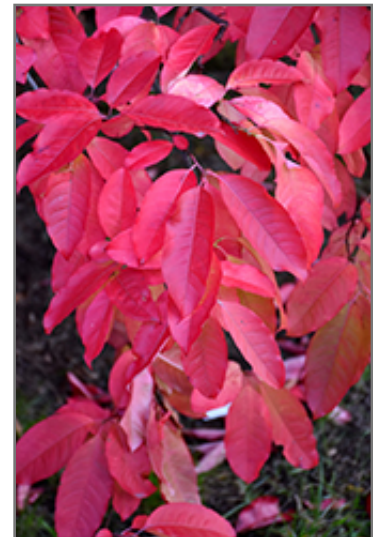
Sourwood in fall