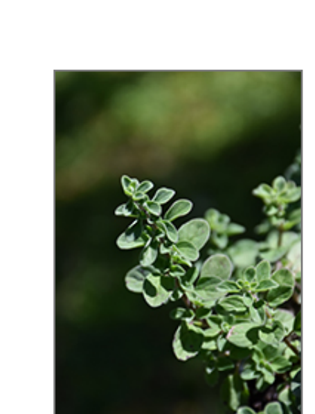
Sweet Marjoram foliage

Sweet Marjoram will grow to be about 24 inches tall at maturity, with a spread of 24 inches. When grown in masses or used as a bedding plant, individual plants should be spaced approximately 20 inches apart. Its foliage tends to remain dense right to the ground, not requiring facer plants in front. Although it's not a true annual, this fast-growing plant can be expected to behave as an annual in our climate if left outdoors over the winter, usually needing replacement the following year. As such, gardeners should take into consideration that it will perform differently than it would in its native habitat.