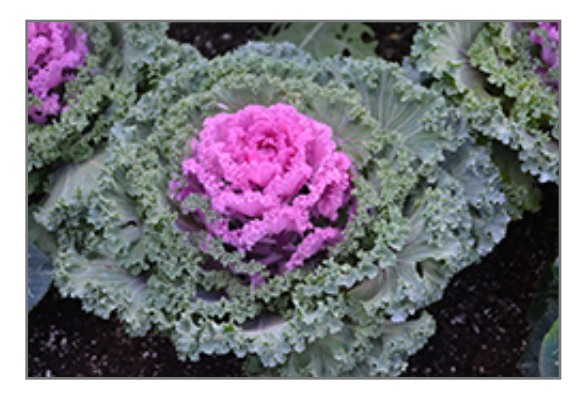
Nagoya Red Ornamental Kale