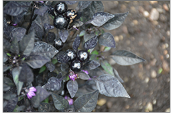
Onyx Red Ornamental Pepper fruit