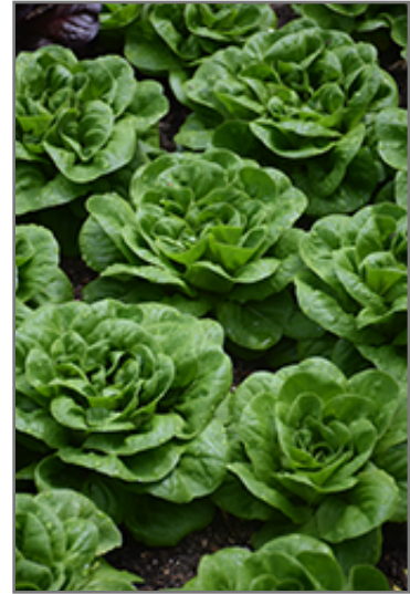
Buttercrunch Lettuce

Buttercrunch Lettuce will grow to be about 12 inches tall at maturity, with a spread of 6 inches. When planted in rows, individual plants should be spaced approximately 8 inches apart. This vegetable plant is an annual, which means that it will grow for one season in your garden and then die after producing a crop. Because of its relatively short time to maturity, it lends itself to a series of successive plantings each staggered by a week or two; this will prolong the effective harvest period.