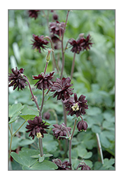
Black Barlow Columbine flowers