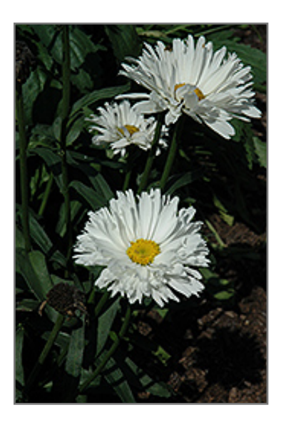
Crazy Daisy Shasta Daisy flowers