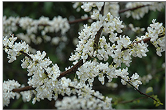
White Redbud flowers