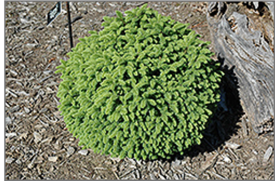
Humphrey's Gem Norway Spruce

Humphrey's Gem Norway Spruce is recommended for the following landscape applications;