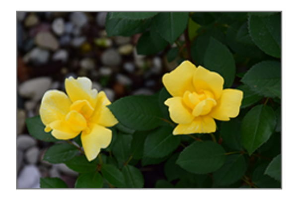
Sunny Knock Out Rose flowers