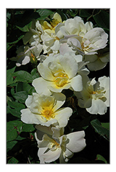
Sunny Knock Out Rose flowers

Rogers 3112 West New Hope Rd. Rogers, AR (479) 633-0200