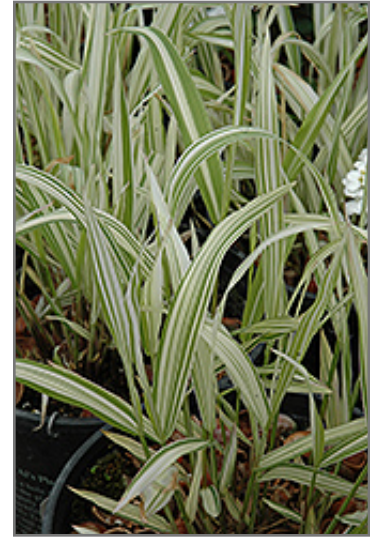
River Mist Northern Sea Oats foliage

River Mist Northern Sea Oats is a fine choice for the garden, but it is also a good selection for planting in outdoor pots and containers. Because of its height, it is often used as a 'thriller' in the 'spiller-thriller-filler' container combination; plant it near the center of the pot, surrounded by smaller plants and those that spill over the edges. It is even sizeable enough that it can be grown alone in a suitable container. Note that when growing plants in outdoor containers and baskets, they may require more frequent waterings than they would in the yard or garden.