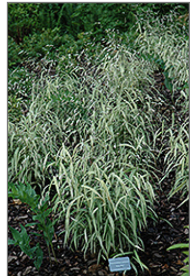
River Mist Northern Sea Oats