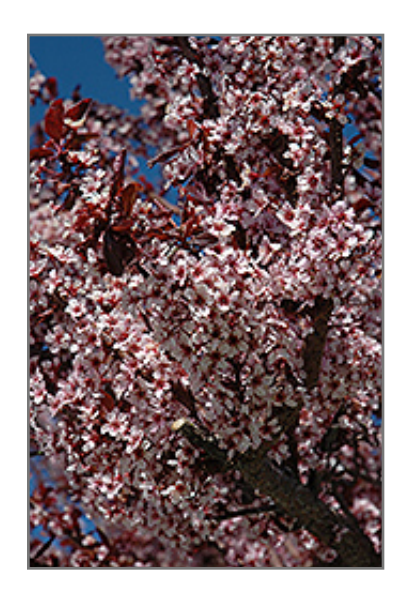
Thundercloud Plum flowers

East Fayetteville 2104 Mission Blvd. Fayetteville, AR (479) 571-1500