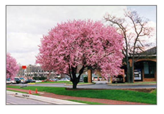
Thundercloud Plum in bloom