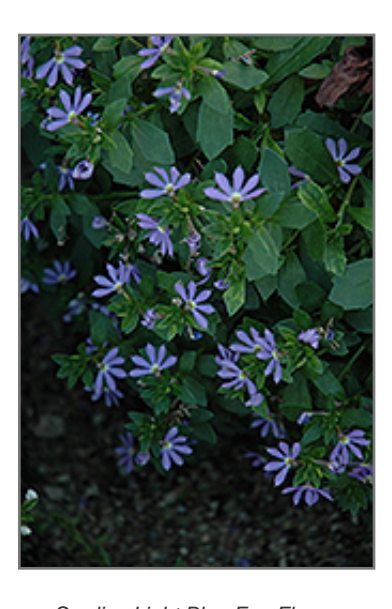
Surdiva Light Blue Fan Flower flowers